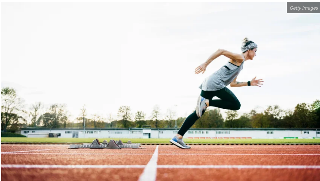
Investors Have Put $43 Billion in Dividend-Paying Funds This Year. Before You 'Chase Dividends,' Here's What to Know