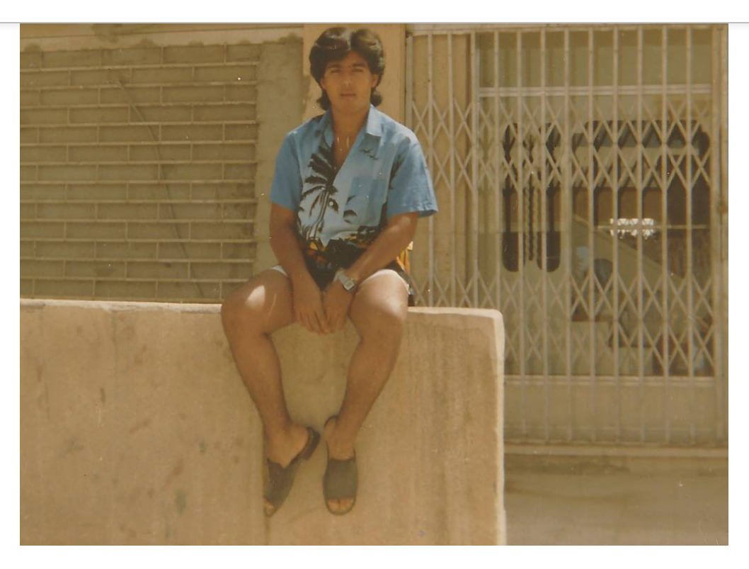
Kash on Aug. 1, 1990. Less than 12 hours later, Iraq would invade Kuwait.

Tune in now to learn how to embrace adversity and use it to build strength.