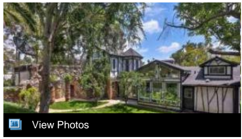
View Photos Lady Gaga reportedly buys Frank Zappa's L.A. home for $5.25 million Fri, Sep 23, 2016 20:38 BST