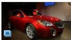
12 cars that depreciate in price quickly and are