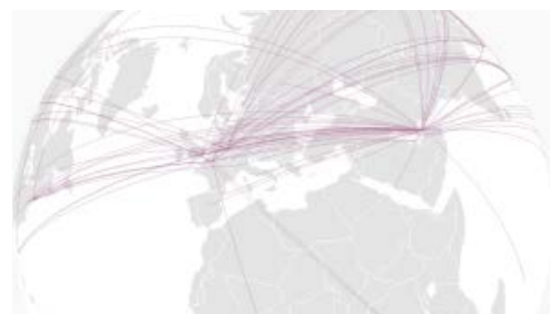
Mapped: Everywhere the A380 flies Quartz - 20 hours ago

Business Insider UK Finance - Mon, Sep 26, 2016 12:10 BST