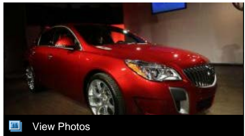
View Photos 12 cars that depreciate in price quickly and are good to buy used Mon, Sep 26, 2016 14:33 BST