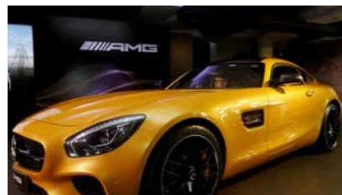
Petrolhead heaven: ten of the most desirable cars to be unveiled at the Paris Motor Show Mark Dorman - 22 hours ago