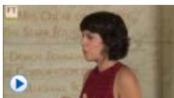
2016 Emerging Voices Film Award Winner