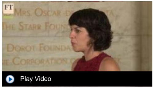
Play Video 2016 Emerging Voices Film Award Winner financial-times - 9 hours ago