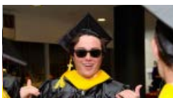
Here's HSBC's rap video for graduate