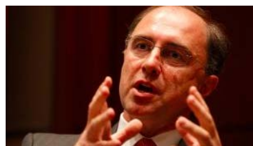
Is the FTSE 100 Rally Real? Morningstar UK - Wed, Sep 21, 2016 12:23 BST