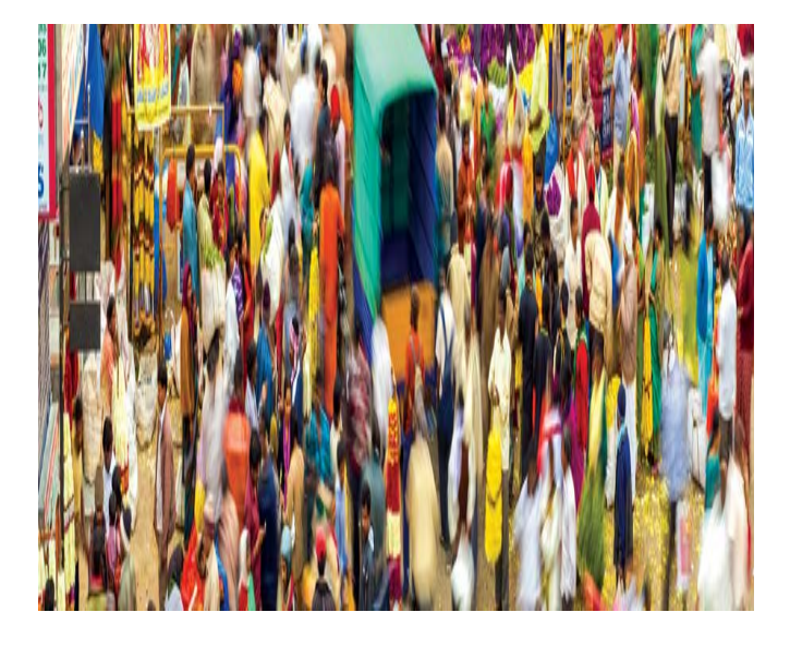
Golden opportunity : Investors believe India's large and growing population could create a huge consumer market.

Investing in India is gaining appeal with advisers