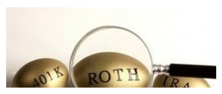
Roth vs. traditional 401(k)s: What to consider for clients