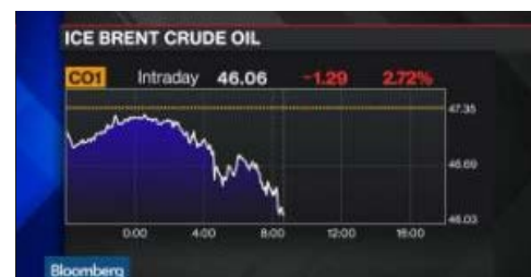
Iran Balks as OPEC Looks for Production Freeze