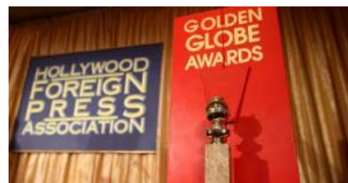
Buying a stake in Dick Clark Productions