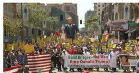
Harsh U.S. election rhetoric spurs Latinos to take action Reuters Videos