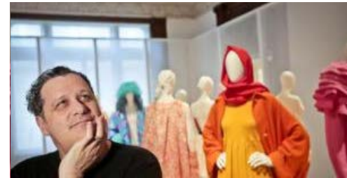
These are a few of fashion icon Isaac Mizrahi's favorite things

"A dollar allocation to active bond funds is not same as a dollar allocation to passive bond funds," said Shah, whose parent company sponsors a family of actively managed mutual funds. "Unlike passive funds, active bond funds have the ability to shorten their duration going into a rate sell-off."