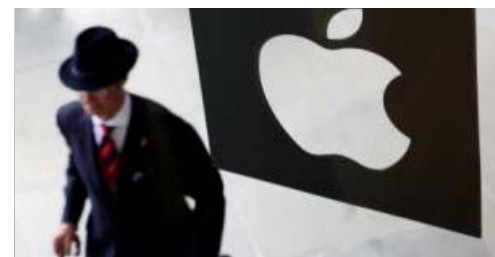
Analyst warns Brexit is bad news for Apple iPhone sales