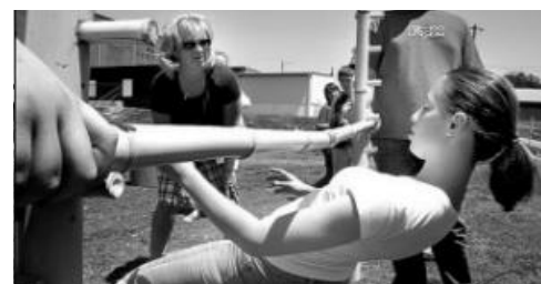
Record lows in US bonds are signalling a reckoning with stocks

"As far as duration is concerned, most of the interest-rate sensitivity is likely already baked into the prices," Ahmed said. "If your portfolio requires a longer duration bond allocation, and you have a long enough investment horizon, then just allocate to what is required."