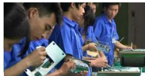
Is China's economy showing signs of stability?