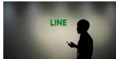
All eyes on upcoming Line offering amid a dismal IPO market