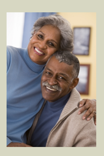
Today, though the scope of Social Security has been widened to include survivor's, disability, and other benefits, retirement benefits are still the cornerstone of the program.